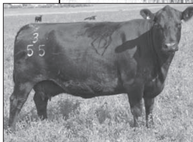
DDA Fahren 21X Daughter