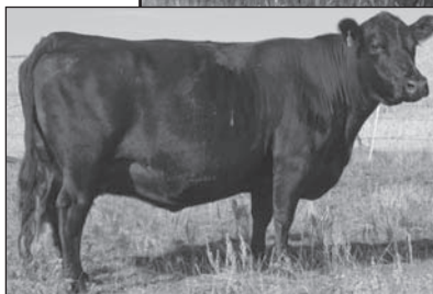
DDA Melisa 824 Mother to 27C and E5H