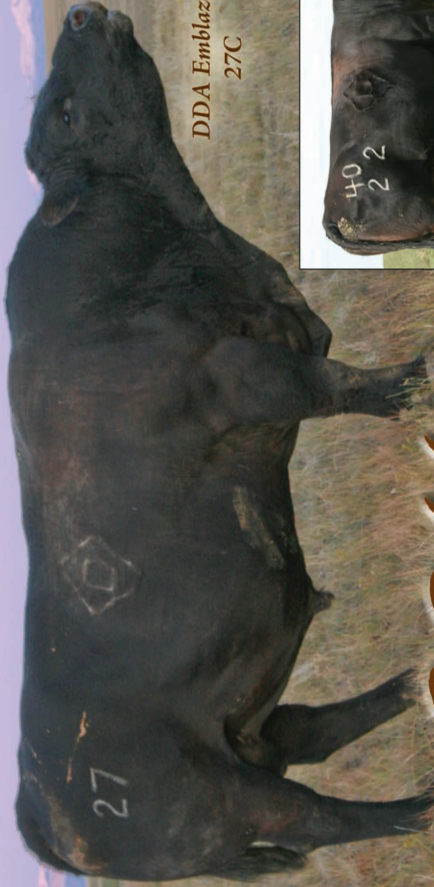
DDA Emblazon 27C