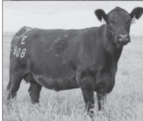
DDA Melisa 808 at two years old. Full sister to E5H